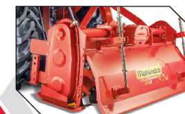
Best fit with Gyrovator