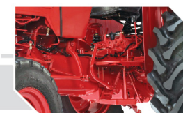
Transmission & Brakes